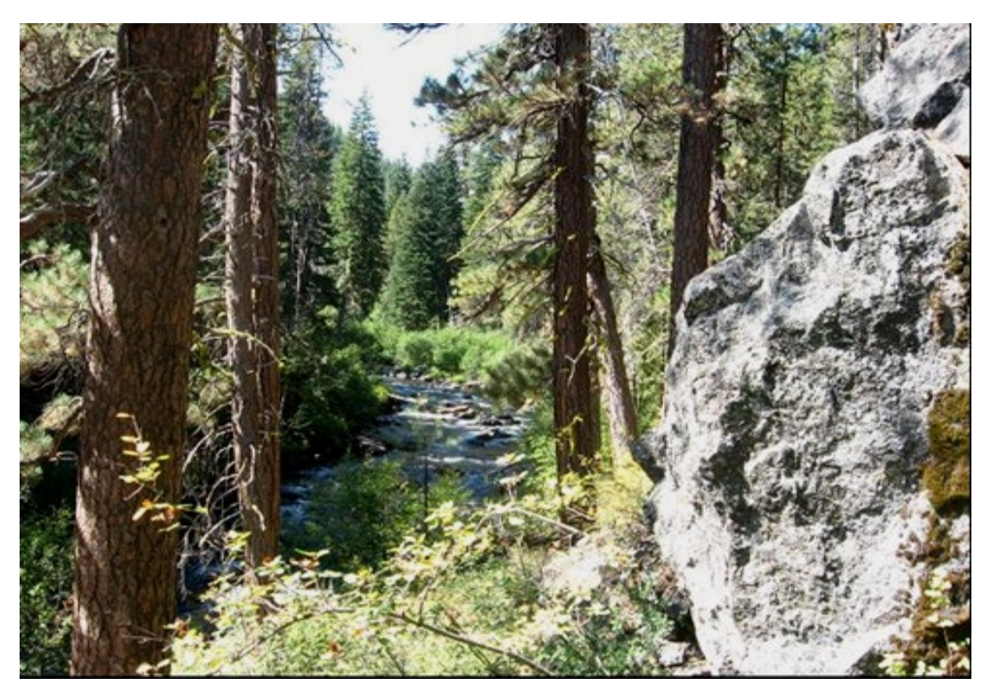
Figure 3. Crescent Creek free-flowing through the Canyon

The scenic vegetation resource of Crescent Creek is considered to be outstandingly remarkable. Scenic and vegetative diversity is unique within the steepness and narrowness of the canyon. A variety of conifers, Engelmann spruce, lodgepole pine, ponderosa pine and some true firs, are visible from the stream. Large old growth ponderosa pines in excess of 24 inches in diameter exhibiting the characteristic yellow-bellied appearance are found scattered throughout. Several large rock outcrops found in the lower sections of the zone add variety to the overall visual landscape. As the creek exits the canyon, the valley floor widens and there is an increase in willows and rose species, which have grown to large sizes. The lack of seen human intrusion creates a feeling of pristine wilderness, close to a major county highway.