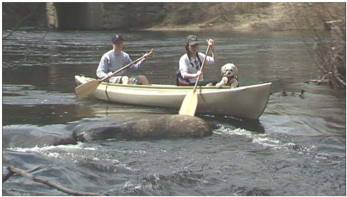
Visitors have a dog-gone good time on the river.