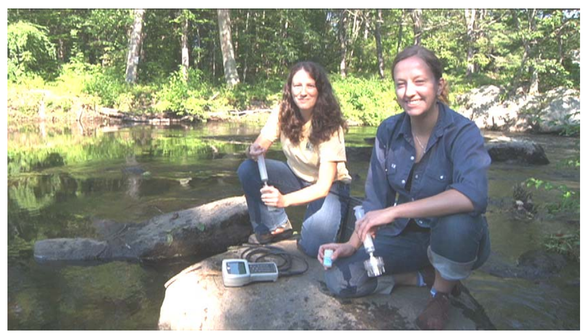
Scientists test the water.