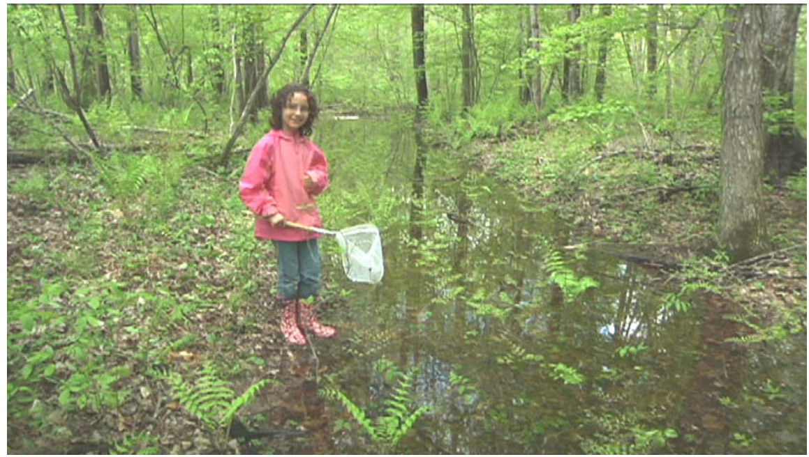
Future land steward enjoys the floodplain on conserved land in Lee.