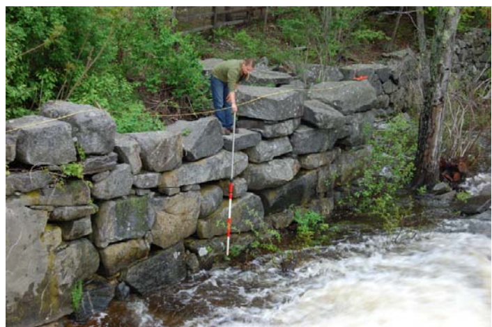
Historian documents the Wiswall Mill foundation in Durham prior to construction of the fish ladder.