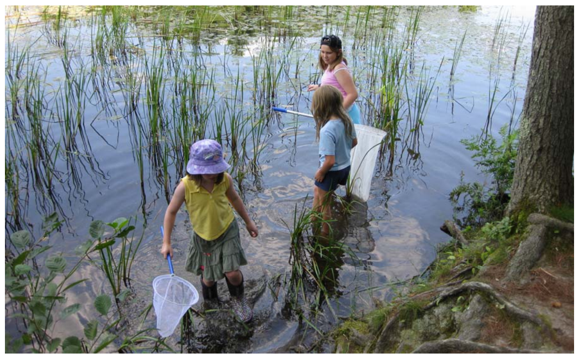
What can dragonflies teach us about the river?