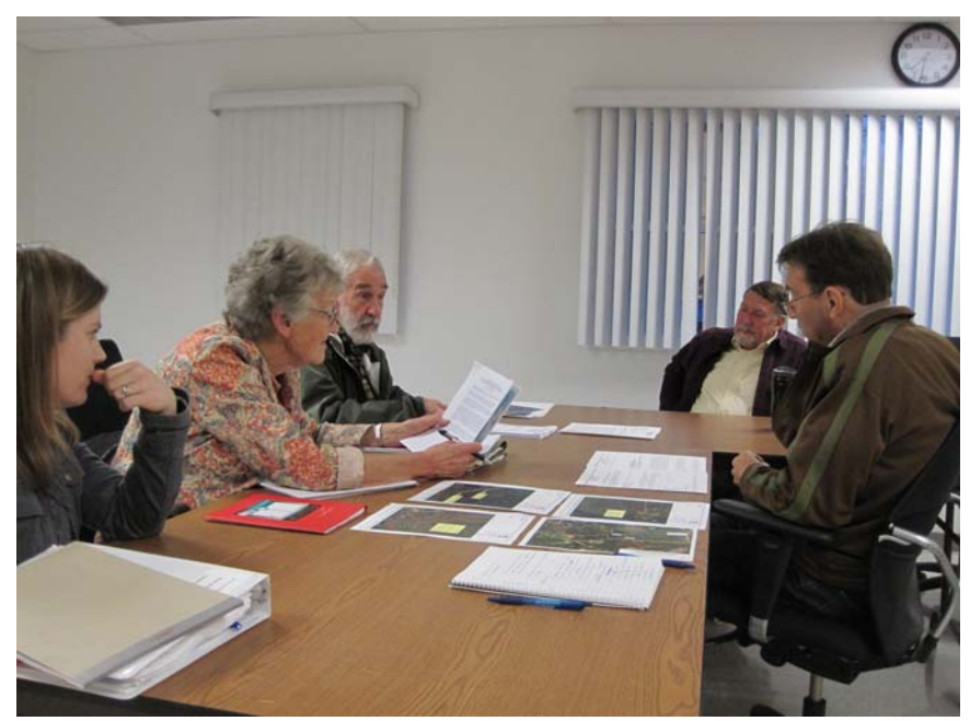
The subcommittee reviews plans.