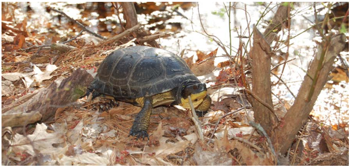
Blanding's turtle rests by a vernal pool.